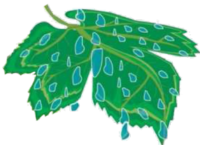
High Volume Sprayer