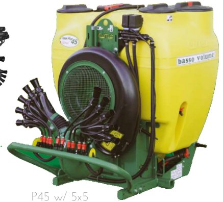
P45 w/ 5x5