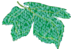
Low Volume CIMA Sprayer